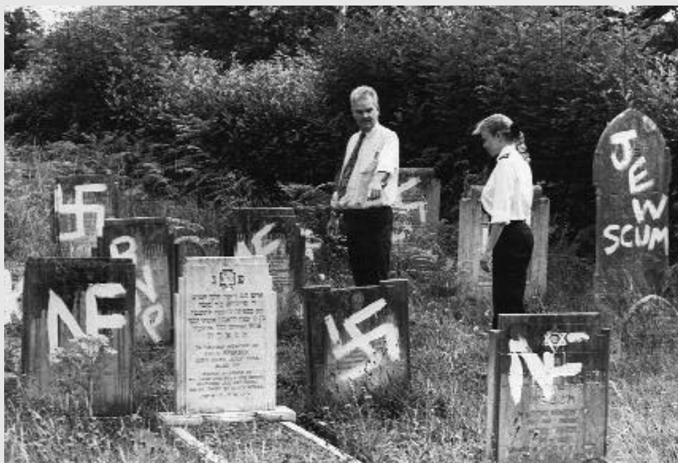
The Jewish Chronicle , 6 August 1993. There is a reference to this appendix in paragraph 8.

Southampton's special graffiti squad has started to clean the gravestones.