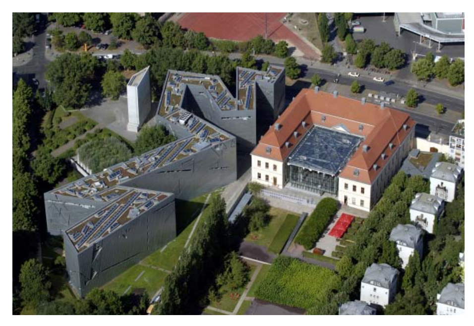
Fig. 5. Jewish Museum Berlin with glass covered 'Sukkah' courtyard of Old Building, 2007