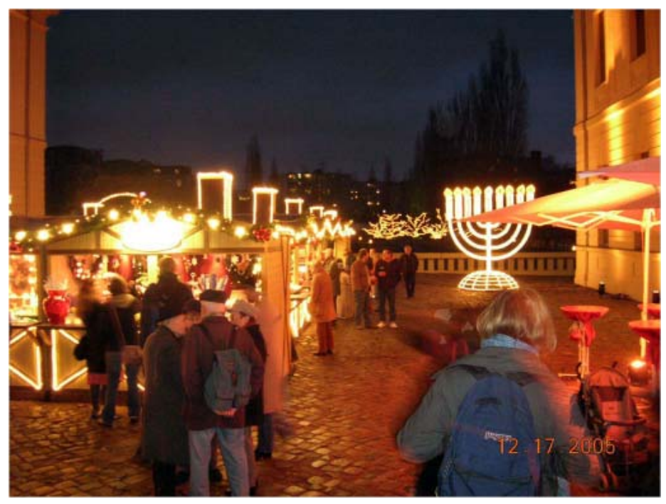
Fig. 12. 'Hanukkah Market,' courtyard of Old Building, December 2005, photo author

It answers the non-Jewish desire to dissolve all the differences and contradictions