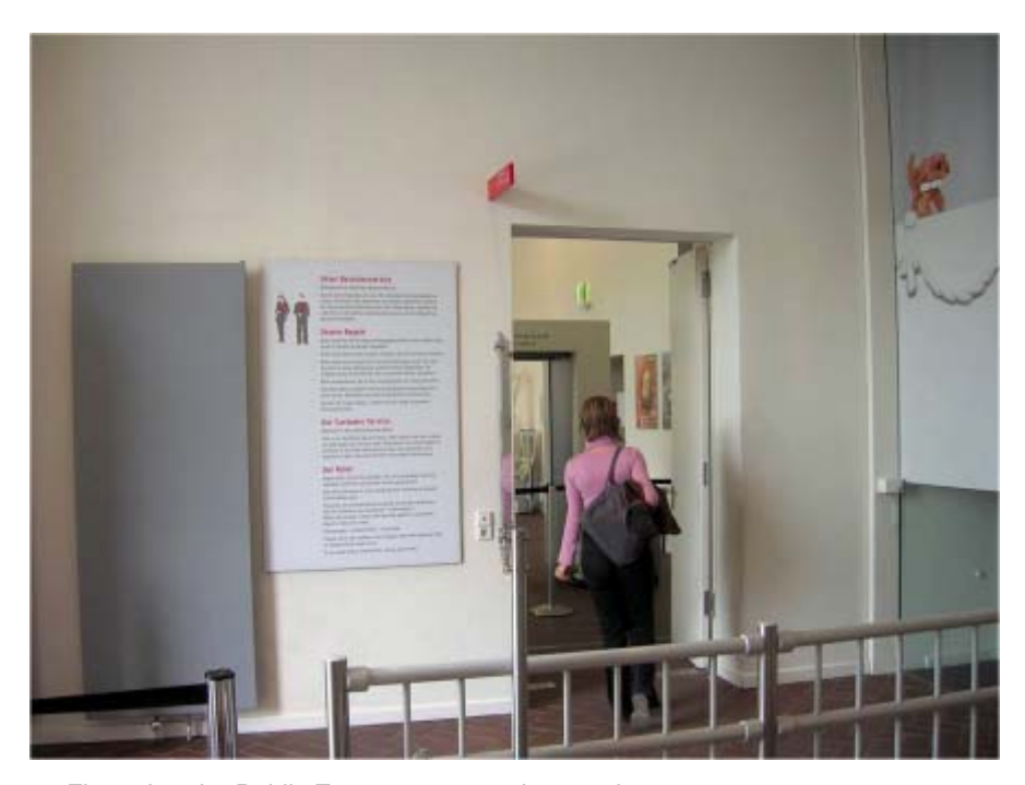
Fig. 8. Interior Public Entrance, 2006

time? How to traverse two millennia of German-Jewish history?' And answered: 'The best way is at the Jewish Museum Berlin... time-travel through German-Jewish history'.<sup>7</sup> While the tourist, particularly in the post-9/11 world, will suffer some discomfort and uncertainty, the ultimate goal is to arrive safely once more at home, having 'tolerated' and then assimilated any otherness experienced along the way to one's own experience within a dominant national culture, in which acceptance of the very idea of a national Kultur , or civilization, is the sine qua non for successful assimilation and participation.