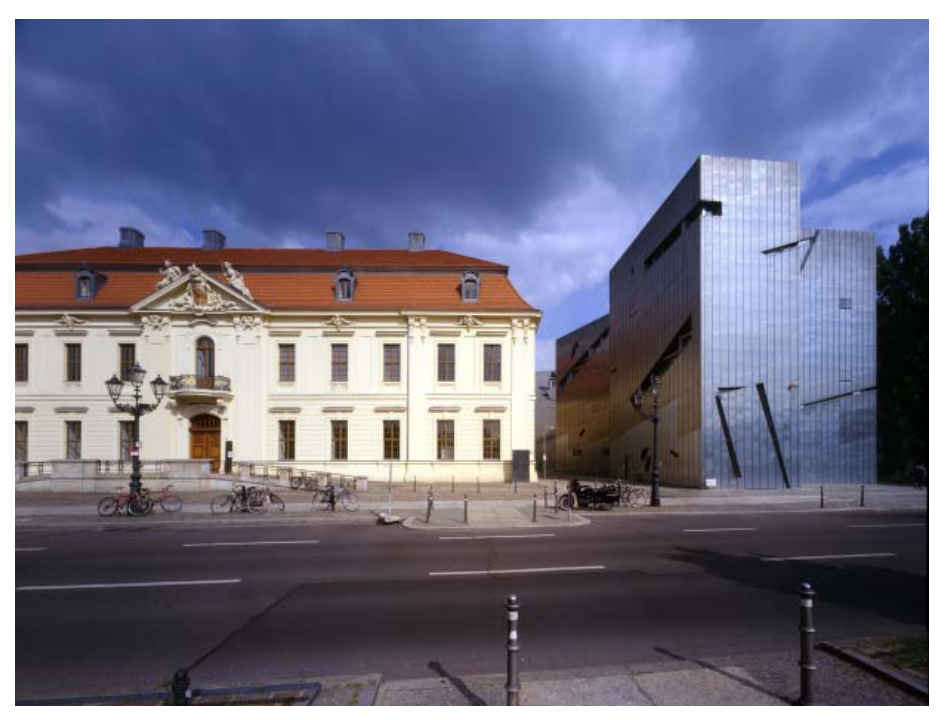
Fig. 6. Old Building (Kollegienhaus, 1735, restored 1963) and Libeskind Building ('Between the Lines', 1998) viewed from the street, photo Bitter+Bredt, Berlin, © Jewis

confronted by the withdrawn exteriors and disturbing interiors the Jewish Museum or the Victoria and Albert extensions, we find ourselves in a phenomenological world in which both Heidegger and Sartre would find themselves, if not exactly 'at home' (for that was not their preferred place), certainly in bodily and mental crisis, with any trite classical homologies between the body and the building upset by unstable axes, walls and skins torn, ripped and dangerously slashed, rooms empty of content and with uncertain or no exits or entrances (Vidler 1999: 238).