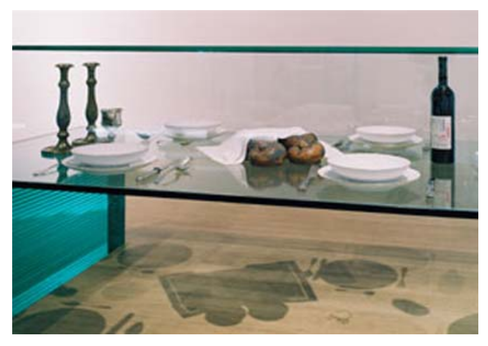
Fig. 18. Shabbat table in the section of the permanent exhibition entitled 'Tradition and Change', photo Thomas Bruns, © Jewish Museum Berlin

encased in plexiglass (fig 18). A pragmatic result of the guardless environment - which must intend to avoid associations with human control, surveillance, and imprisonment - this display of objects of everyday Jewish existence as 'objects of ethnography' (Kirshenblatt-Gimblett, 1991) also evokes the Nazi's Central Jewish Museum, in which artefacts mundane and magnificent would provide anthropological evidence of extinction. Resonating amidst this