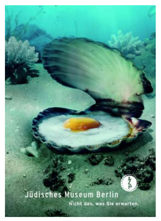
Fig. 1. Scholz & Friends, 'Jewish Museum Berlin. Not What You Are Expecting,' Advertisement, 2002, © Jewish Museum Berlin

The JMB's long, complex, and controversial period of development and design - from temporary exhibitions in the 1960s, to concepts for a permanent display as a Jewish department in the Berlin History Museum, or the integration of Jewish history throughout that collection, to that for a self-sufficient museum of Jewish Berlin, and finally, Jewish Germany - has been well-chronicled elsewhere (Offe 2000: 147-151 & 183-199, Pieper 2006: 196-236, Young 2000: 154-173). Likewise, the museum building (fig. 2), designed by Daniel Libeskind and opened to the public without displays in 1999 and with them installed in 2001, has also received