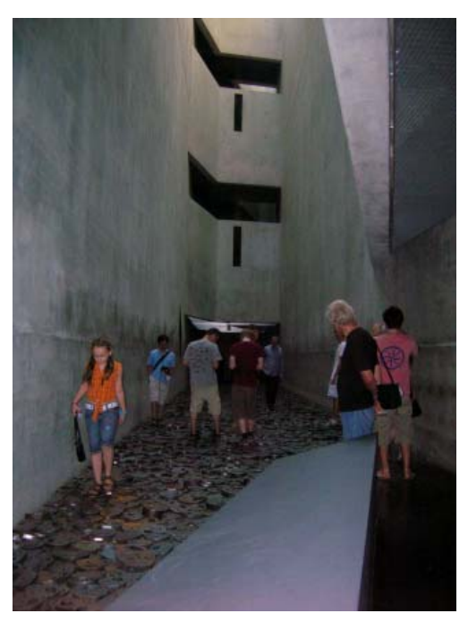
Fig. 20. Menashe Kadishman installation Shalechet (Fallen Leaves), 'Memory Void,' 2007

or existential challenges. The Museum has also filled the void, with matter and with sound where that has been permitted. In the so-called 'Memory Void,' a towering internal courtyard, visitors