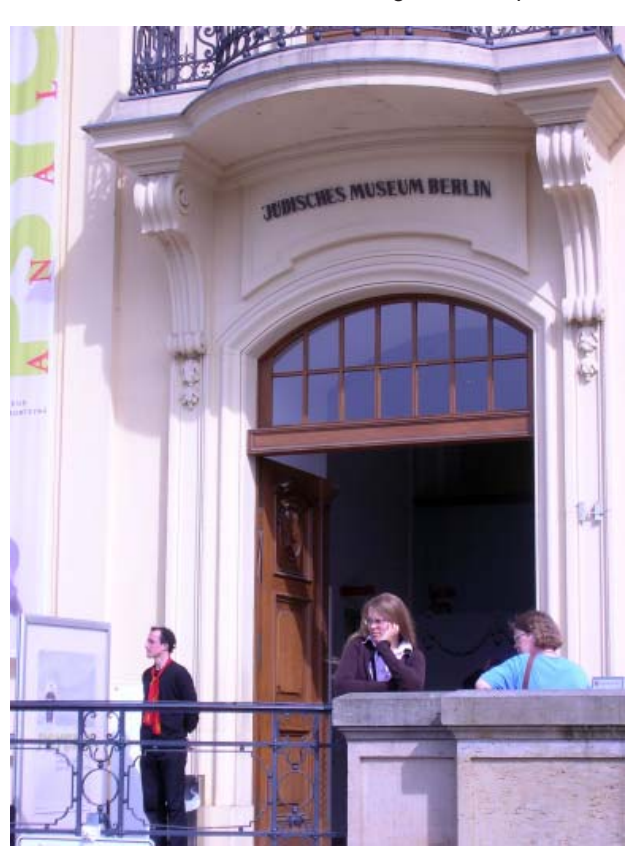
Fig. 9. Exterior Public Entrance, 2006

the familiar bourgeois familial sphere. Second, the exhibits stress Jewish integration into the general fabric of German society. The German Jewish community from the Enlightenment up to the Nazi reaction had indeed achieved remarkable, if qualified, assimilation to German social life and values. The JMB's ultimate goal is to preserve and celebrate this history of assimilation and cooperation and to use it to promote a qualified tolerance of cultural diversity in contemporary Germany - to define the German national narrative as one that can be inclusive of some degree of religious and ethnic difference. By qualified, I mean a tolerance that accepts differences that still comply with normative, modern, western social practices, privileging particularly a national identity that transcends religion and ethnicity. Such tolerance invites industrious individuals, rooted in strong families, to encourage their subgroup's participation in, and contribution to, the progress of the national society,