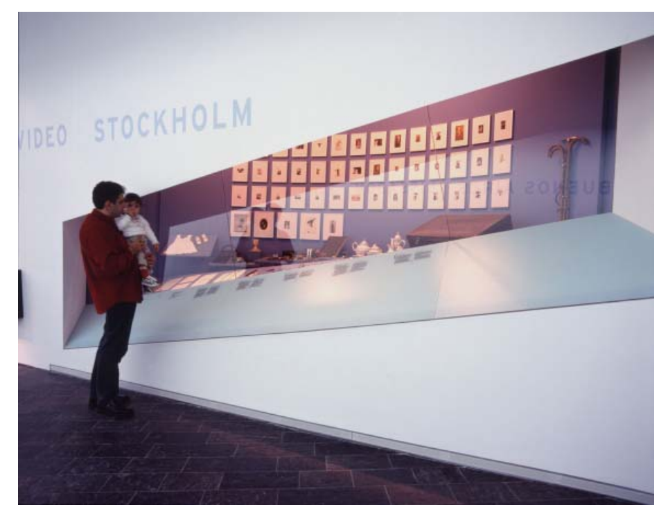
Fig. 15. Axis of Exile, photo Hans Grunert, © Jewish Museum Berlin

year round'.<sup>17</sup> The 'Sukkah' courtyard sits opposite the staircase leading down to the Libeskind building, and down to the areas of the museum most concertedly dedicated to the visceral experience of Jewish persecution and annihilation. To access the museum's permanent collection, visitors must descend and traverse this lowest, subterranean level. It consists of three axes, the Axis of Continuity, the longest leading to the stairs to the permanent exhibition (and so also the route of exit from the museum), The Axis of Exile and Emigration, leading to the E.T.A. Hoffmann Garden, and the Axis of the Holocaust, leading to the dead end of the Holocaust Tower (fig. 14). The Raphael Roth Learning Center, a museum education facility featuring interactive exhibits, is also annexed to these axes. Along the axes objects and images accompanied by expository texts are exhibited rather discretely in vitrines recessed into the walls (fig. 15). One encounters, for instance, a Singer sewing machine that once belonged to the Berlin tailor and Auschwitz victim Paul Gutermann. Emphasis falls on family histories, and