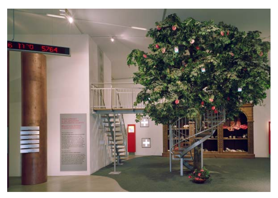
Fig. 17. 'The Beginnings', with pomegranate 'Wish Tree', photo Thomas Bruns, \circledcirc Jewish Museum Berlin