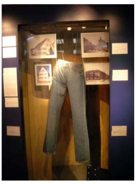
Fig. 19. Levi Strauss Display, 2006

Intermittently, one comes to a darker area without objects, abutting one of the sealed, interior voids (fig. 4). On many visits to the Museum I have observed that visitors pay them little heed, notice them only as passageways to be traversed, or empty areas to be avoided, and not as metaphysical