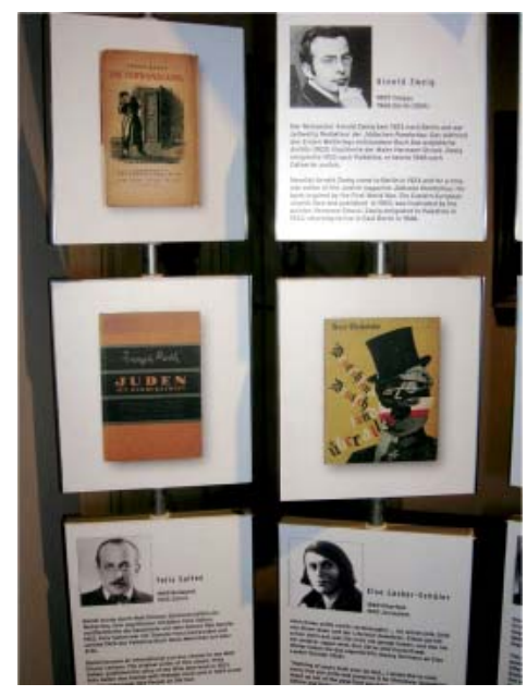
Fig. 11. Display of rotating panels with book covers and authors, 2006

For both the permanent and temporary JMB exhibits, Kugelmann stresses three essential elements: the presentation of objects, their staging through installation, and texts interpreting them. The visual comes first: '[t]hemes for which strong visual material exists are a better basis for an exhibition than those that rest on conceptual constructs'. So, while the story of German Jewish emancipation from the founding of the Second Empire through the First World War is very important historically, it is 'not very visual' and so not conducive to exhibition. 'In conceiving of the JMB's exhibition programme our first consideration is which themes in Jewish history and culture are