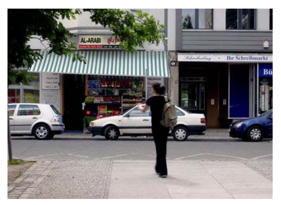
Fig. 23. Al-Arabi Grocery, facing museum at end of E.T.A. Hoffmann Promenade, 2006