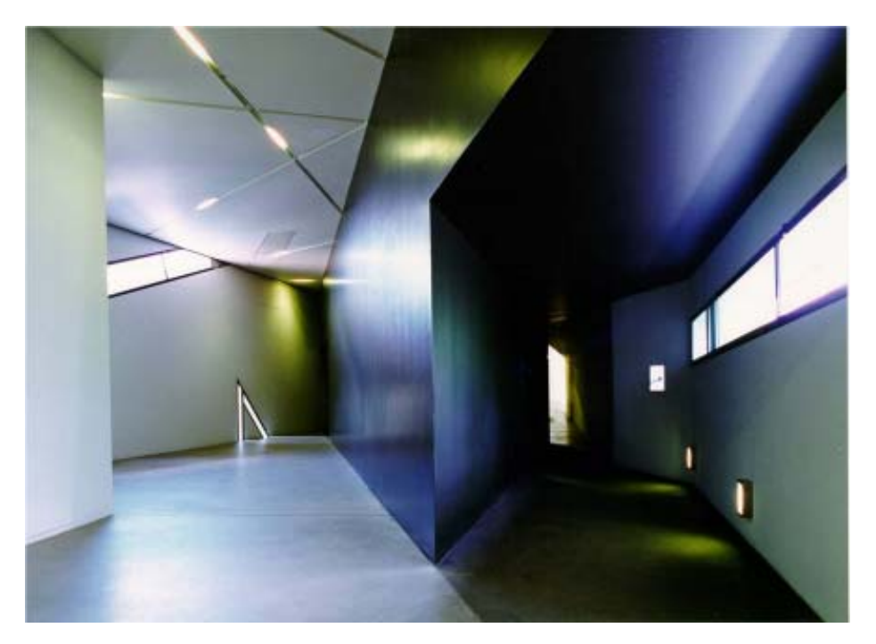
Fig. 3. Interior, Jewish Museum Berlin, prior to installation of exhibits, 1999, photo Susan Felleman

about one-fifth what it was in 1933, the German Jewish community, Europe's fastest-growing, has tripled since unification, largely due to the influx of tens of thousands of immigrants from the former Soviet Union.