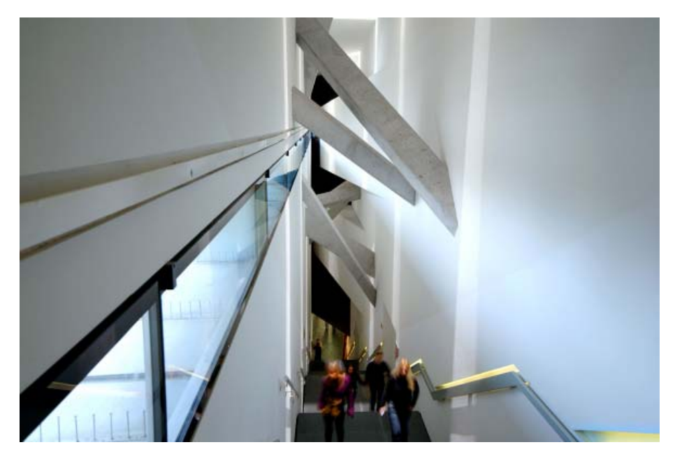
Fig. 16. Ascending Stairs from Subterranean Axes to Permanent Exhibition, photo @ Michele Nastasi