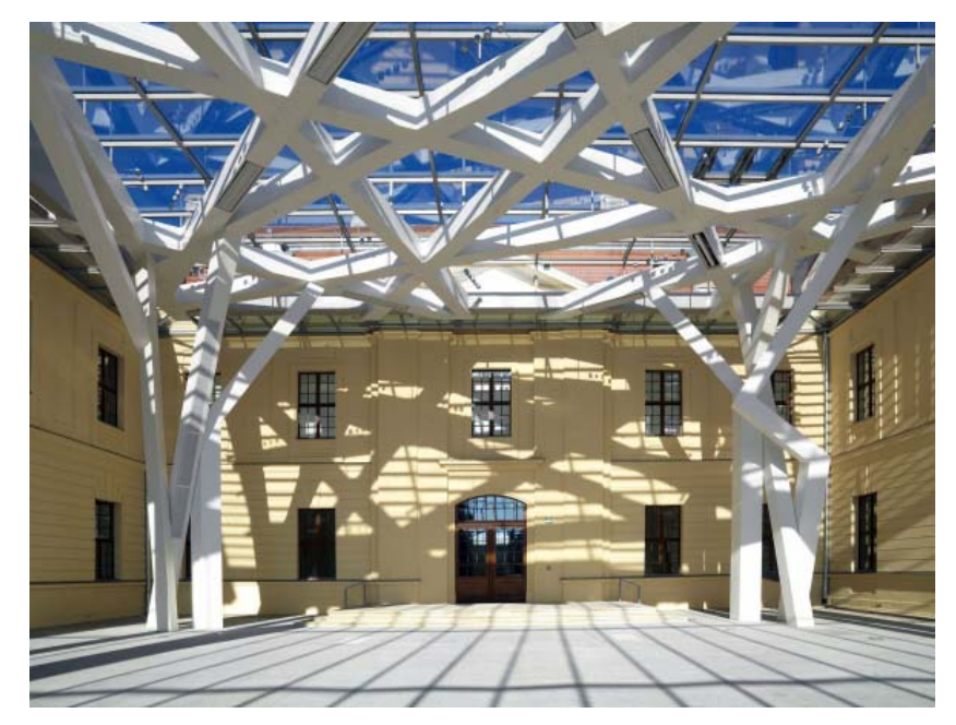
Fig. 13. Glass 'Sukkah' Courtyard, opened September 2007