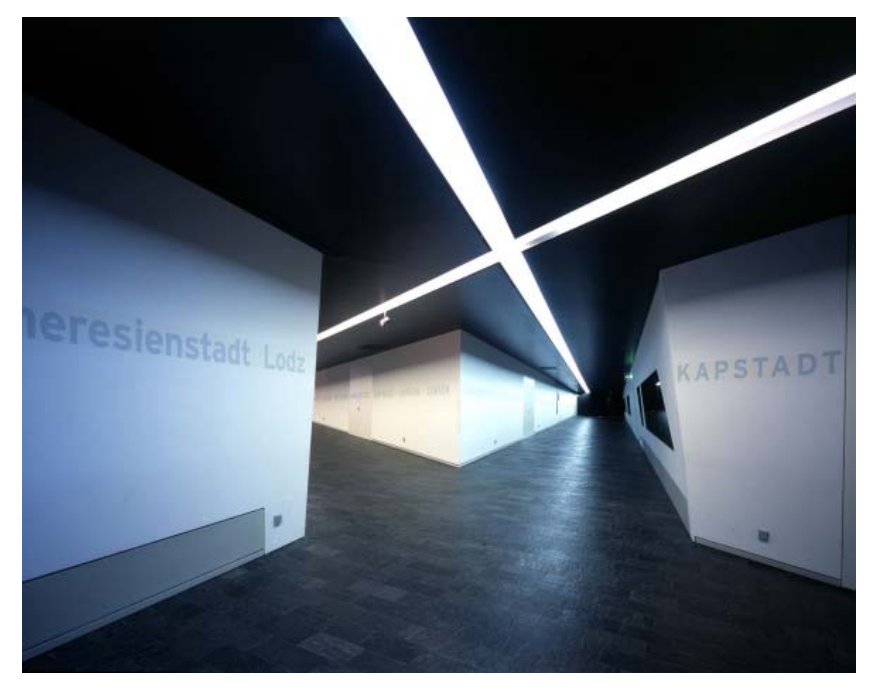
Fig. 14. The Subterranean Axes