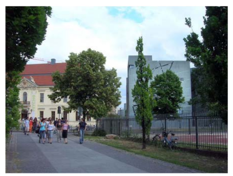
Fig. 22. E.T.A. Hoffmann Promenade, view towards museum, 2006