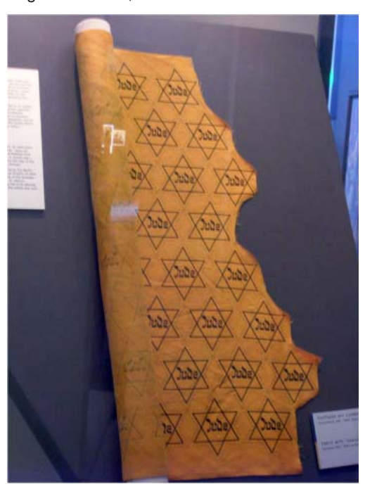
Fig. 21. Roll of fabric yellow stars, 2006

Just as it offered choice (a defining and cherished principle of liberal, capitalist democracies) at the beginning, so too does the exhibition's conclusion, through the visitor polls and by menas of a general question asking them to comment on their