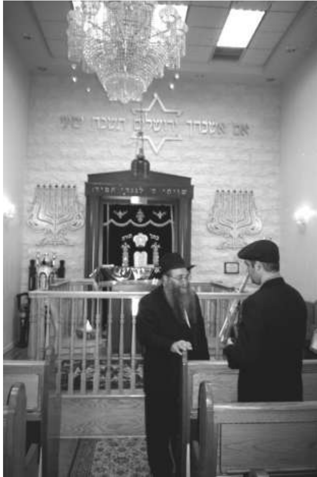
inside the synagogue of Jews of Caucasus in New-York