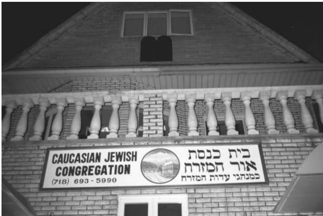
Photo by Chen Bram, outside the synagogue of Jews of Caucasus in New-York: synagogue's name