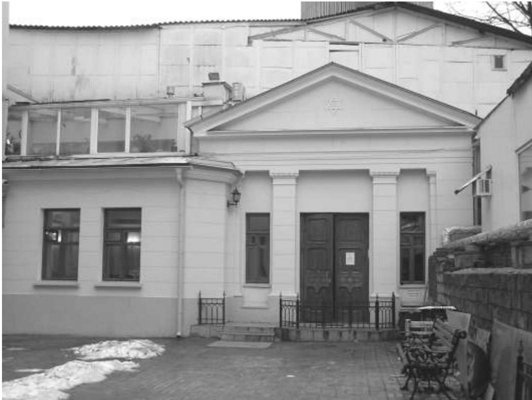
outside the “Beit Tanhum” ( Beit Tanhum "בית תנחום") synagogue of Jews of Caucasus in Moscow