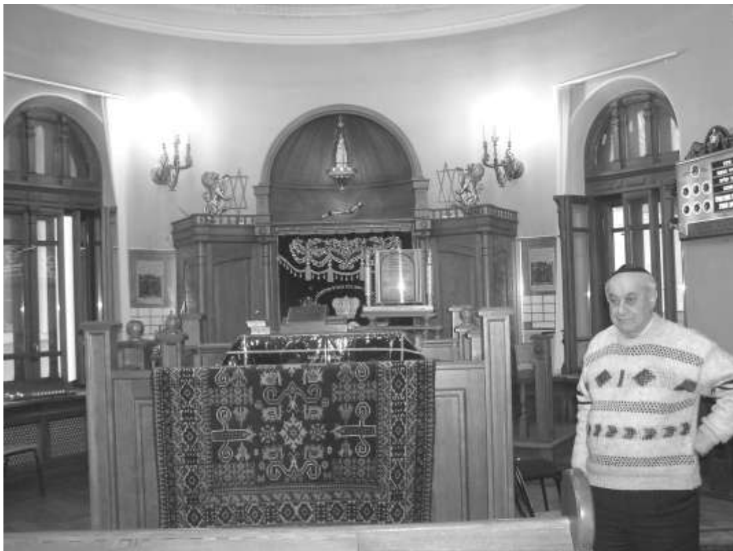
inside the hall of separate Minyan of Caucasian Jews in the Big Synagogue building in Moscow