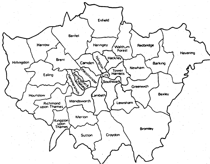
THE LONDON BOROUGHS