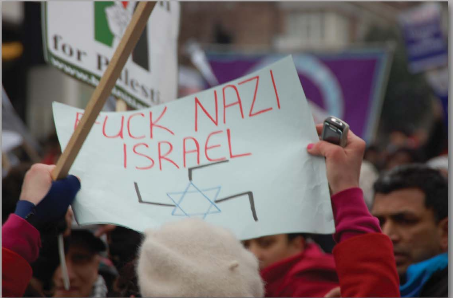
This photograph was taken on one of the many anti-Israel demonstrations that occurred in Central London during the December 08-January 09 conflict between Israel and Hamas in Gaza and Southern Israel.