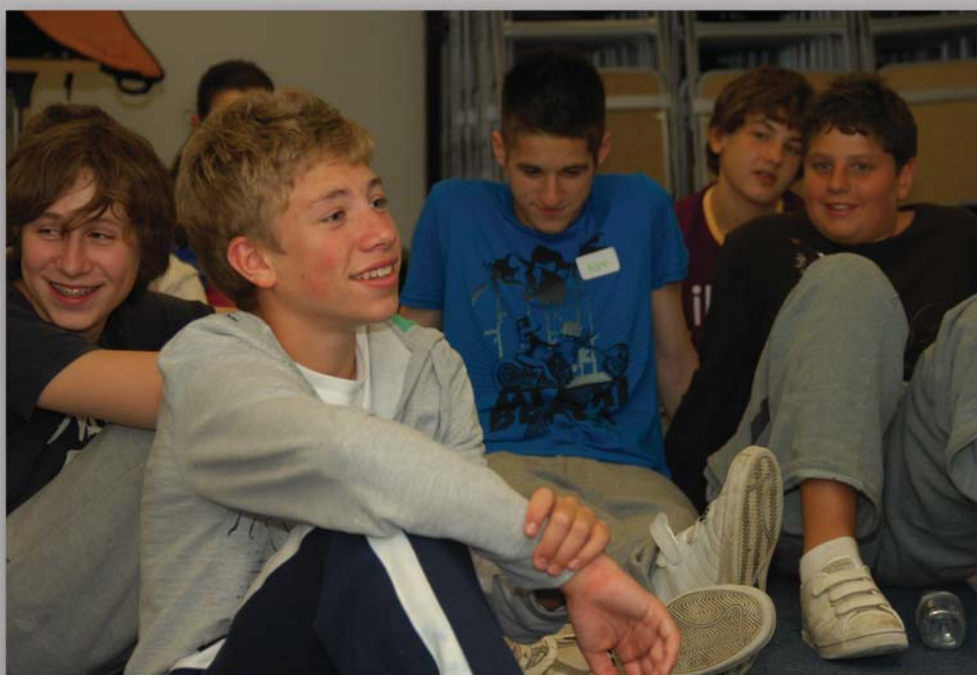
Jewish teenagers attending a course in personal safety and development, run by the community's Streetwise initiative.

The Jewish population is in decline due to low birth rate, intermarriage and emigration. The strictly orthodox minority is experiencing sustained growth due to larger family sizes and may in future comprise the majority of the Jewish community.