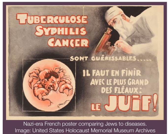
Nazi-era French poster comparing Jews to diseases.

in eastern Europe. 5 In the twentieth century, Jews were blamed for typhus by the Nazis. 6 In 2019, Jews were blamed for a measles outbreak in New York City. 7 It was therefore sadly inevitable that Jews would be blamed in some circles for coronavirus in the twenty-first century, it is a continuation of an historical scapegoating.