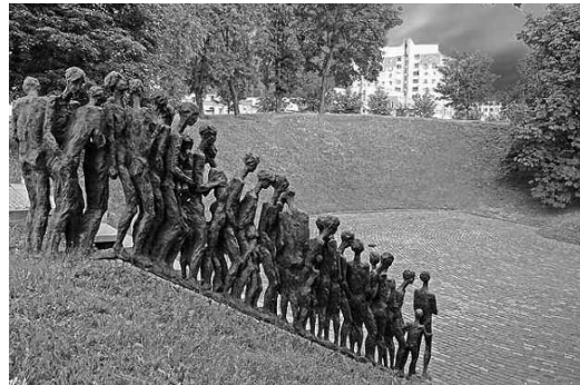
Memorial 'Jama' erected in 2008. Minsk.