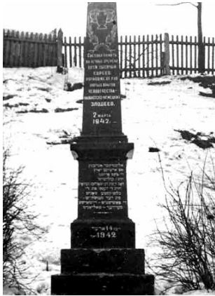
Memorial Holocaust Stone erected in 1947 in 'Jama'. Minsk.