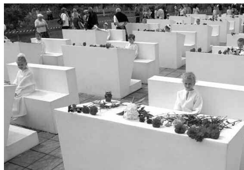
Memorial 'Krasny Bierah' opened in 2007 in Homiel region. Fragment.