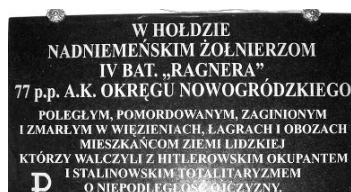
Polish Memorial Plaque into the Roman Catholic Church of St. Barbara, Lida, Hrodna region.