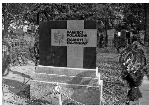
Polish Monument in Baranavičy.