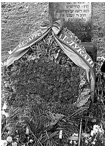
Memorial Wreath from President Aliaksandr Lukašenka to the commemoration of the victims of Holocaust in Belarus.