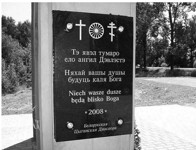
Roma Memorial in Kaldyčava, Baranavičy district.