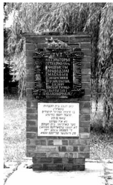
Roma and Jewish Holocaust Monument in Pinsk.