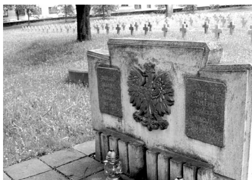
Polish Monument at Hrodna cemetery.