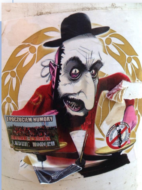
Antisemitic poster, Hertfordshire, June 2014

Outside Greater London and Greater Manchester, CST recorded 64 antisemitic incidents from 33 different locations around the UK in the first six months of 2014, compared to 46 incidents from 29 different locations in the first half of 2013. The 64 antisemitic incidents recorded around the UK included ten in Leeds, eight in Hertfordshire, seven in Liverpool and four in Bradford.