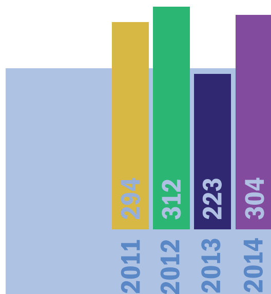
Number of antisemitic incidents recorded by CST in the first six months of each year, 2011–2014

Therefore it is likely that the increase in the number of incidents either reflects a genuine increase in the number of incidents that are taking place, or an improvement in the reporting of incidents to CST and the Police by members of the Jewish community and the wider public – or a combination of these two factors.