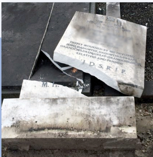
Damaged gravestone at Blackley Cemetery, Manchester, June 2014

There were 27 incidents of Damage & Desecration of Jewish property recorded by CST in the first six months of 2014, an increase of 35 per cent from the 20 incidents of this type recorded in the first half of 2013. There were 29 incidents recorded in this category in the first six months of 2012 and 35 during the same period in 2011.