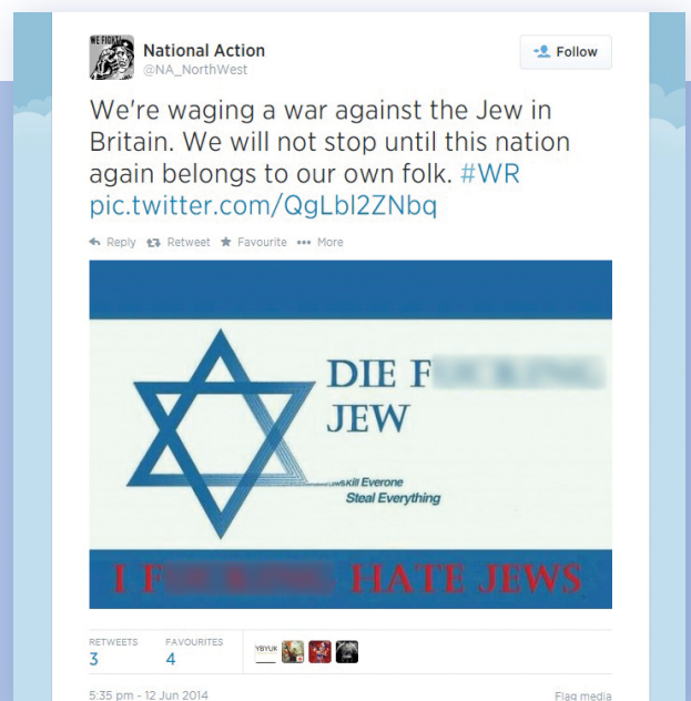
Antisemitic tweet, June 2014