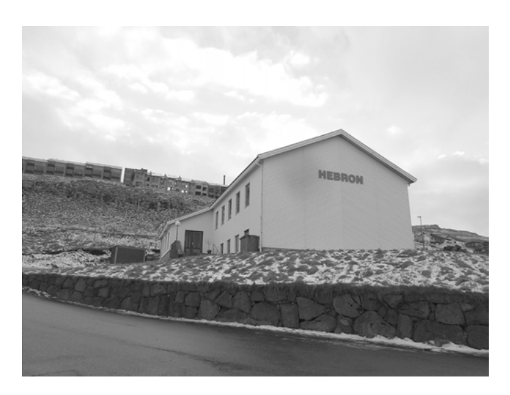
Figure 11.2: Hebron is a small Plymouth Brethren congregation in Argir, just outside the capital Tórshavn, which started its activities in the 1930s. The "new" Hebron (depicted above) opened its doors in 1992.

Brethren or other denominations) in villages and towns. On several occasions, Jewish religious and political dignitaries visiting the Faroes, for instance Yitzhak Eldan (in spring 2001), then Israeli ambassador to Denmark, have talked about the "Israel-friendly" Faroe Islands, alluding to less friendly (or even hostile) neighbouring Scandinavian countries voicing criticisms about Israeli policies.<sup>20</sup> Faroe Islanders supporting the Scandinavian countries' relatively critical standpoints towards Israeli policies (usually regarding the situation of the Palestinian population) often keep silent in order not to enrage pro-Israel religious communities and their political allies in the Faroes. Actually, most Faroe Islanders seem to be more interested in the cultural history and geography of Christianity than in what takes place in the Knesset in twenty-first-century Israel. This reflects the past/present/future temporal dimension – and its boundaries – in the presentation of Jews and Israel in Faroese narratives and discourse.