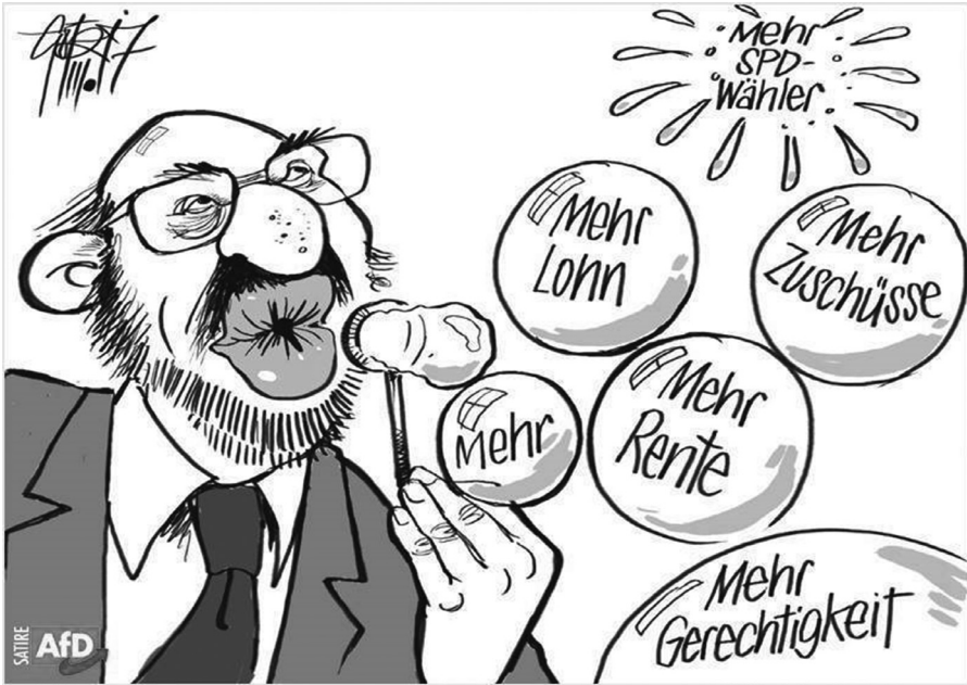
FIGURE 3. Frauke Petry's Facebook post of a meme depicting political opponent, Martin Schulz, with stereotypical antisemitic attributes.

picture. Also, in order to read the complete text accompanying images, readers are often required to open the whole post by clicking on “show more”—therefore it is not automatic that the text will be read in full or given equal priority to the image.