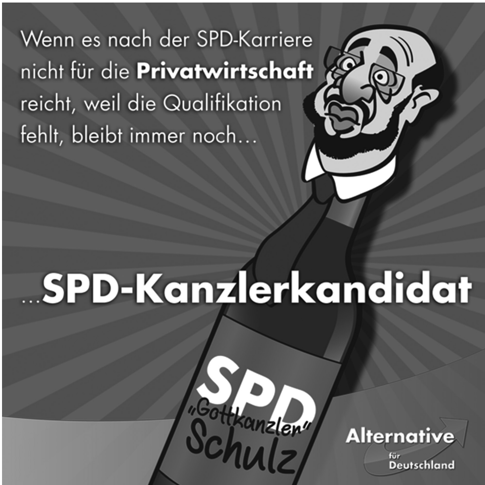
FIGURE 2. Bjorn Höcke's Facebook post of a meme representing political opponent, Martin Schulz, with stereotypical Jewish physical attributes.

Although the caricature does not have a manifestly antisemitic purpose, it implicitly applies anti-Jewish attributes to Schulz's face. Because these are associated with inner values, such as a malicious character, this post relies on a concept that comes from the tradition of antisemitic caricatures. 34 Thus, the image seeks to discredit Schulz by implicitly associating him with negative stereotypes of Jews.