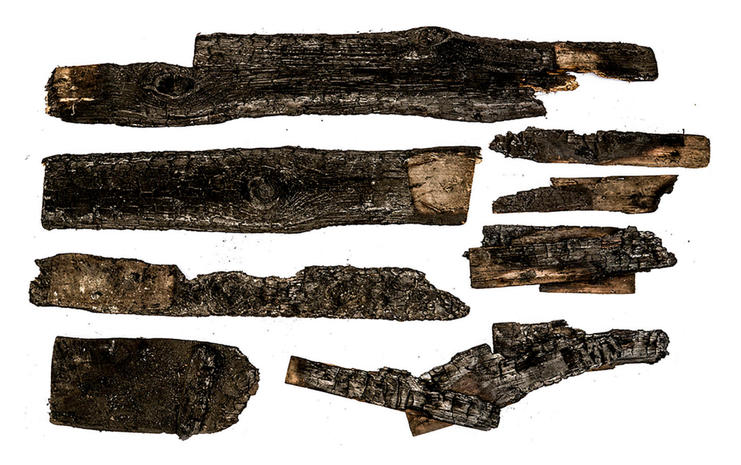
Figure 3. S moldered planks from a demolished Jewish house in Biłgoraj. Photo: Dominika Macocha 'Dom,' 2021.

tombstones converted after the war into grindstones. A similar practice exists in rural Poland, too, where small items from Jewish households are being offered on sale to Jewish tourists.<sup>71</sup>