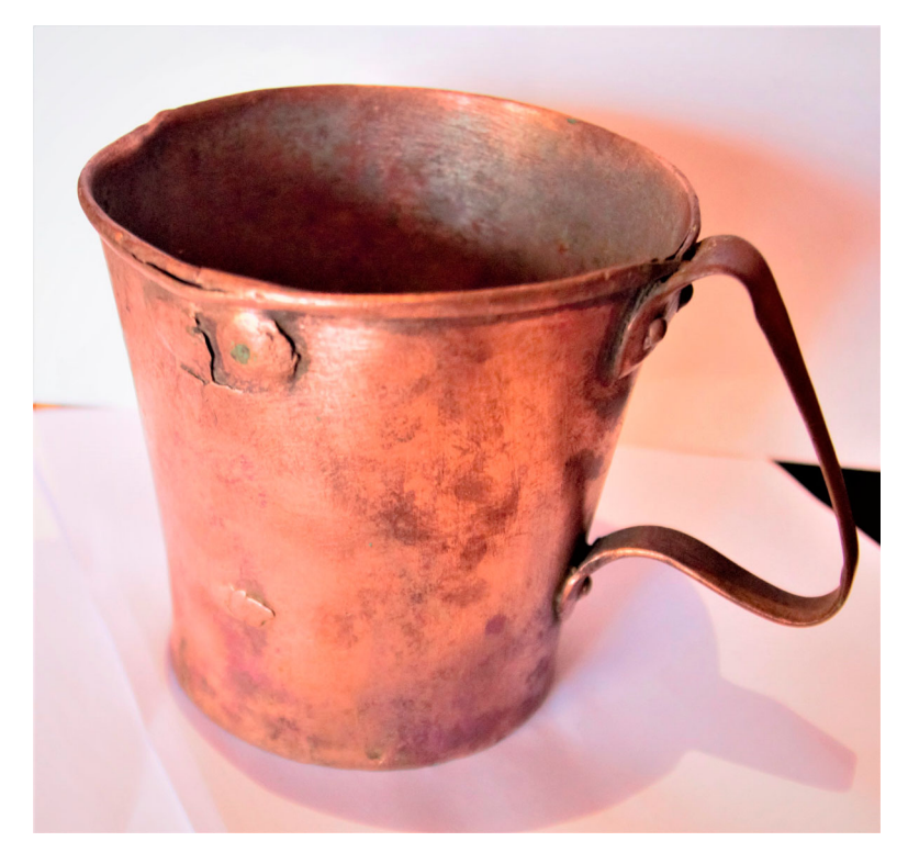
Figure 1. A repurposed Jewish ritual washing cup on sale at the local souvenir shop in Mir, 2022.

was the melody of 'So speaketh Abaji and Raba' emanating from these pages. I left, threw away the butter, and pocketed the sacred piece of text. ^{51}