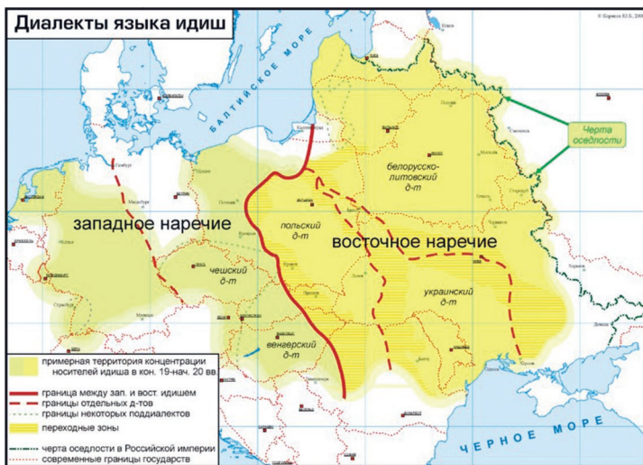
Figure 2. Map of traditional dialects of Yiddish (in Russian) (Koryakov 2008) https://commons.wikimedia.org/wiki/File:Yiddish-dialects-ru.png Creative Commons Attribution-ShareAlike 3.0 Unported (CC BY-SA 3.0 Unported)

They proudly showed that people spoke German from eastern France to the Volga in the Soviet Union, and from Finland and Leningrad (St Petersburg) in the north to Trieste, the Danube and the northern Black Sea littoral in the south (Kamusella 2019). Obviously, in the eastern three-quarters of this area users of German were none other than Ashkenazic Jews in their majority (cf. Figure 2). They would typically refer to their language as Yiddish rather than German. But a German- and a Yiddish-speaker do not have many problems in communicating, apart from some Slavic and Hebrew words not employed in standard German (Ikhveysnit 2010) The standards of both languages share the same dialectal base of Middle German(ic) (see Figure 3).