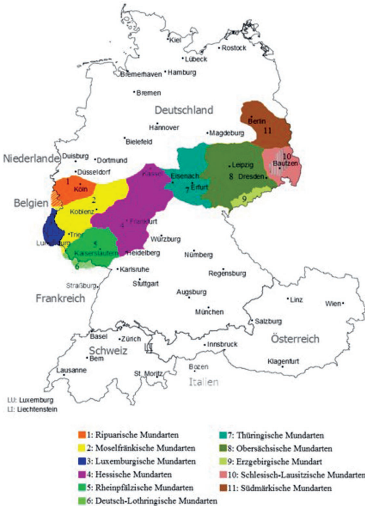
Figure 3. A map of the Central German Dialect/Mitteldeutsche Mundarten nach 1945 (ohne Pennsylvaniadeutsch, Siebenbürgisch-Sächsisch) (Brichtig 2012) https://commons.wikimedia.org/wiki/File:Mitteldeutsche_Mundarten.png Creative Commons Attribution-ShareAlike 3.0 Unported (CC BY-SA 3.0 Unported)

guages of Montenegrin and Serbian are also written in these two alphabets as a matter of course. An educated Montenegrin or a Serb does not even notice in which script a perused newspaper or book happens to have been published.