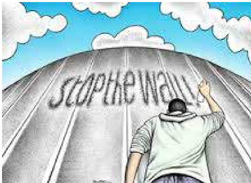
Ben Heine, Stop this Wall , 2008.

https://www.flickr.com/photos/benheine/2218654770